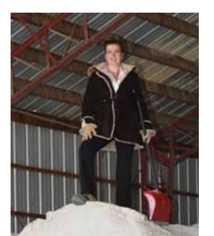
It's important to build a culture where employees think of safety first, says Arlington.